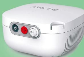
Designed For Family