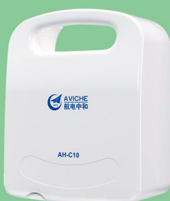
Designed For Hospital